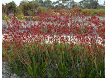
Anigozanthos species Kangaroo Paws

Native tufted perennials. Many cultivars available. Pictured: Big Red