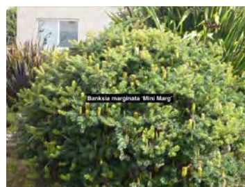
Banksia marginata 'Mini Marg' Dwarf Silver Banksia Native shrub 4 x 3m. Sun.