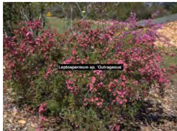
Leptospermum sp. 'Outrageous'