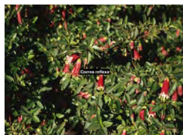
Correa species Native Fuchsia

Indigenous and native varieties and habit. Sun or part shade Pictured: Canberra Bells