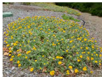
Chrysocephalum apiculatum Common Everlasting

Indigenous prostrate succulent ground cover. Mauve flowers. Full Sun