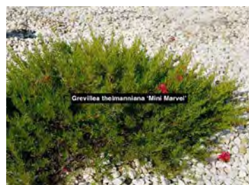
Grevillea thelemanniana 'Mini Marvel'

Indigenous shrub 1.5 x 1.5m. Fast growing sun or part shade.