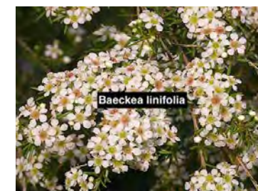
Baeckea linifolia Baeckea Native shrub. 2 x 2m. Pendulous, white star flowers. Sun or part shade.