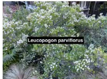
Leucopogon parviflorus Coast Beard-heath

Native shrub 2 x 2m. Red pink flowers. Sun, light shade.