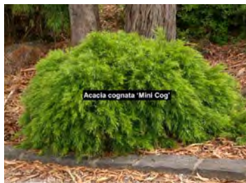
Acacia cognata 'Mini Cog' River Wattle

Native shrub 1 x 1.5m. Sun or light shade.