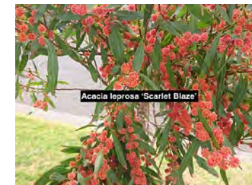
Acacia leprosa 'Scarlet Blaze' Cinnamon Wattle Native Wattle 4 x 3m Weeping habit. Sun or part shade.