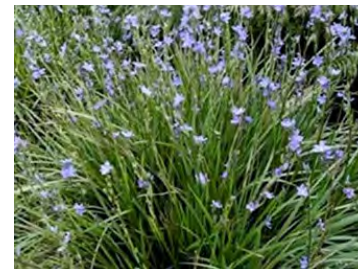
Orthrosanthus multiflorus Morning Flag

Native Iris 50 x 50cm. Sun or part shade.