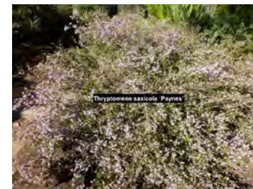
Thyptomene saxicola 'Paynes' Heath Myrtle

Indigenous shrub 1-2m. Sun or part shade.