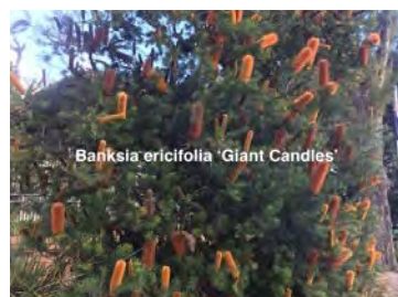
Banksia ericifolia 'Giant Candles' Heath Banksia Native shrub. Cultivar 'Giant Candles' 5m Acid soil. Sun or part shade.