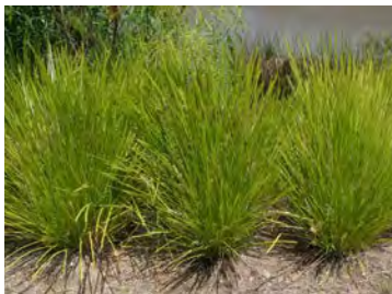
Lomandra hybrids 'Lime Tuff' Mat Rush

Native tufted perennial. 50 x 20 cm. Spring Summer flowers (white). Full sun.