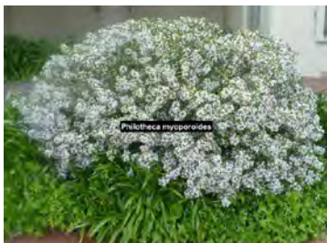
Philotheca myoporoides Long Leafed Wax-flower