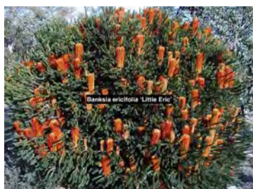
Banksia ericifolia 'Little Eric' Heath Banksia Native shrub. Cultivar 'Little Eric' 1-5 m Acid soil. Sun or part shade.