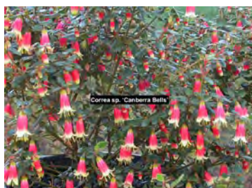
Correa species Native Fuchsia

Indigenous and native varieties and habit. Sun or part shade Pictured: Alba