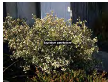
Spyridium parvifolium Dusty Miller

Evergreen 2m. Moist soils in part shade. Purple flowers and aromatic foliage.