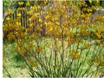
Anigozanthos species Kangaroo Paws

Native tufted perennials. Many cultivars available. Pictured: Big Red