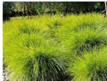
Lomandra hybrids 'Little Pal' Mat Rush