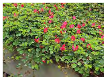
Kennedia prostrata Running Postman

Evergreen native ground cover. 15cm high x 1m wide. Purple flower. Full sun.