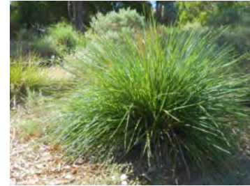
Dianella brevicaulis Coast Flax Lily

Native tufted perennials. Many cultivars available. Pictured: Yellow Gem