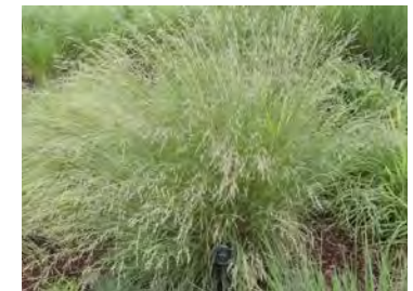
Poa labillardierei Common Tussock Grass

Native Iris 50 x 50cm. Sun or part shade.