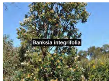
Banksia integrifolia Coast Banksia

Large native tree 15 x 6m. Often mistaken for Banksia marginata.