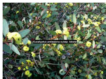
Eucalyptus preissiana subsp. lobata