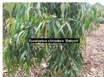
Corymbia citriodora 'Babycit' Dwarf Lemon Scented Gum Native grafted Gum. 'Babycit' 6 x 6m.