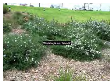
Westringia 'Mundi' Coast Rosemary

Evergreen native. Selection of species and cultivars available. Sun.