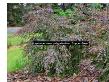
Leptospermum sp. 'Copper Glow' Tea-tree

Native shrub 2-3m red flowering. Bird attracting. Well drained soil in sun.