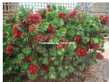
Callistemon viminalis 'Little John'

Native. Cultivar 'Kings Park Special' 4 - 5m Sun. Heavy or light soil. Few or no remnant fruit.