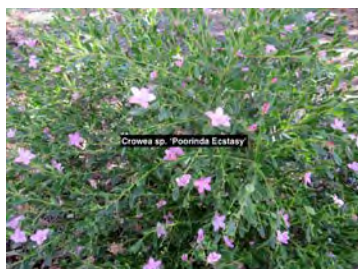
Crowea hybrid 'Poorinda Ecstasy'