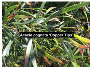
Acacia cognata 'Copper Tips' Bower Wattle Native shrub. Cultivar 'Copper Tips' 4 x 3m Sun light shade.