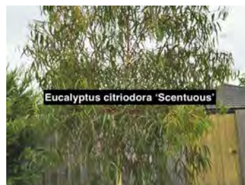
Corymbia citriodora 'Scentuous' Dwarf Lemon Scented Gum Native grafted Gum. 'Scentuous' 7 x 3m. Sun.