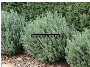
Westringia 'Grey Box' Coast Rosemary

Native shrub various species and sizes available. Colour. Sun.