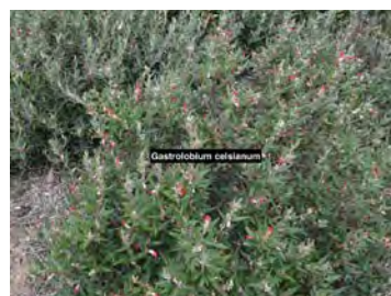
Gastrolobium syn. Brachysema celsianum

WA native 2 x 3m. Prefers acid sands. Sun.