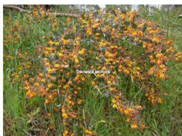
Daviesia latifolia Coast Bitter-pea

Native shrub 2 x 2m. Sun or light shade.