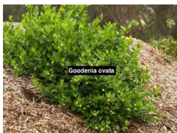
Goodenia ovata Hop Goodenia

Native shrub 1.5 x 1.5m. Sun. Benefits from clipping.