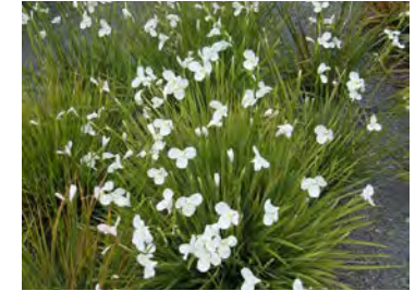
Diplarrena moroea Butterfly Flag

Indigenous Flax. 40 x 40cm. Sun or shade.