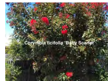
Corymbia ficifolia (grafted) 'Baby Scarlet' Flowering Gum Native small tree. Compact variety 'Baby Scarlet' 3 x 3m Many more variatals available.