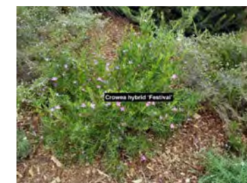
Crowea hybrid 'Festival' Crowea

Native shrub 70 x 70cm. Hardy decorative native shrub. Full sun to half shade.