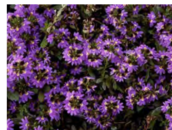
Scaevola species Fan Flower

Native ground cover 15cm x 1-2m. Sun part shade.