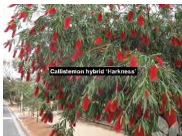
Callistemon hybrid 'Harkness'