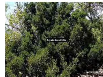
Alyxia buxifolia Sea Box

Native shrub 2.5 x 2.5m. Cultivars 'Swan River' and 'West Coast Gem'. Sun.