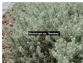
Westringia 'Smokey' Coast Rosemary

Evergreen native. Selection of species and cultivars available. Sun.