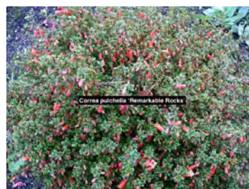
Correa species Native Fuchsia

Indigenous and native varieties and habit. Sun or part shade Pictured: Relexa