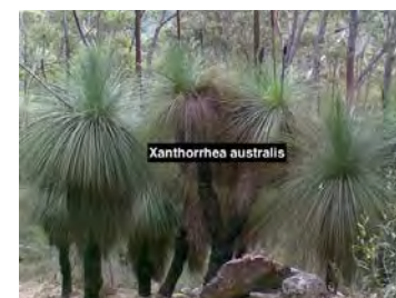
Xanthorrhoea australis Austral Grass tree

Evergreen native. Selection of species and cultivars available. Sun.