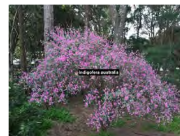
Indigofera australis Austral Indigo

Native shrub 30cm x 3m. Well drained soil in sun.