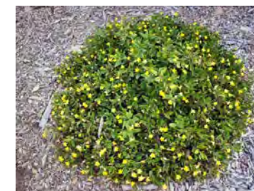
Goodenia ovata 'Gold Cover' Prostrate Goodenia

Indigenous climber. Sun or part shade. Light climber. 1m spread.