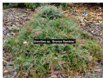
Grevillea hybrid 'Bronze Rambler' Prostrate Grevillea

Native shrub 30cm high x 1m. Well drained soil and sun.