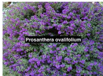
Prostanthera ovalifolia Mint Bush

Evergreen 2m. Moist soils in part shade. Purple flowers and aromatic foliage.