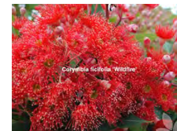
Corymbia ficifolia (grafted) 'Wildfire' Flowering Gum Native small tree. Compact variety 'Wildfire' 6 x 4m Many more variatals available.