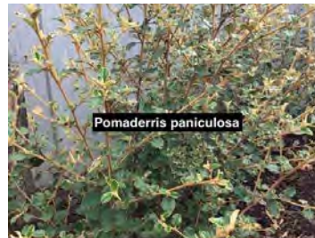
Pomaderris paniculosa sup. Paniculosa Coast Pomaderris

Indigenous shrub 3 x 2m. Sun or part shade. Slow growing.