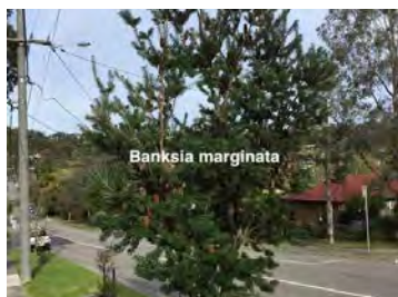
Banksia marginata Silver Banksia Indigenous tree 5-6m x 3-4m. Sun or light shade.