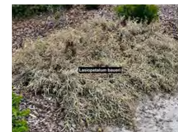
Lasiopetalum baueri Slender Velvet Bush