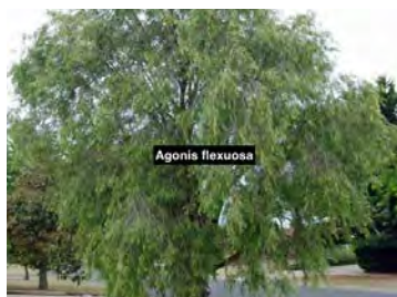
Agonis flexuosa Willow Myrtle