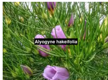
Alyogyne hakeifolia Native Hibiscus

Native shrub 1 x 1.5m. Sun or light shade.