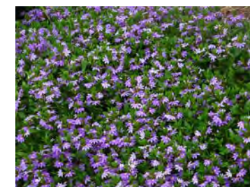
Scaevola species Fan Flower

Native ground cover 20 x 60cm. Many cultivars available. Sun. Pictured: Aemula