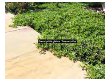
Eremophila glabra 'Roseworthy'

Native shrub. Cultivar 'Murchison Magic' 1 x 1.5m Bird attracting desert plants. Sun.