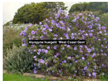
Alyogyne huegelii Native Hibiscus

Native shrub 2.5 x 2.5m. Cultivars 'Swan River' and 'West Coast Gem'. Sun.