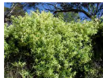
Clematis microphlla Small-leaved Clematis

Indigenous prostrate ground cover. Silver foliage yellow flowers. 1m spread.