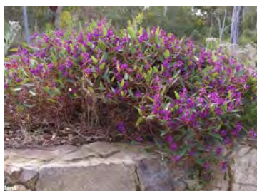
Hardenbergia violacea 'Mini Magic' Native Wisteria

Evergreen native ground cover. 15cm high x 1m wide. Purple flower. Full sun.