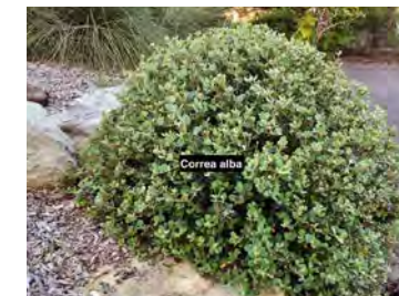
Correa species Native Fuchsia

Indigenous shrub 1.5 x 1.5m. Sun part shade. Slow growing.