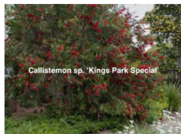
Callistemon sp. 'Kings Park Special'

Native. Cultivar 'Harkness' 6m weeping Sun. Heavy or light soil. Few or no remnant fruit.