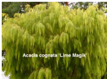
Acacia cognata 'Lime Magic' Bower Wattle Native shrub. Cultivar 'Lime Magic' 4 x 3m Sun light shade.