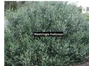
Westringia fruticosa Coast Rosemary

Indigenous shrub 2 x 2m. Sun or part shade.