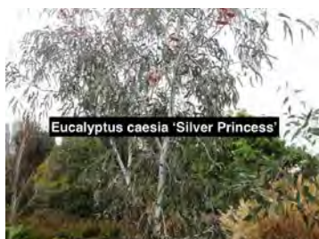
Eucalyptus caesia 'Silver Princess' Gungurra Native weeping Gum 6-8 x 3-4m. Sun.