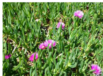
Carpobrotus rossii Karkalla

Evergreen 30 x 30cm. Frequent blue daisy flowers. Full sun part shade.