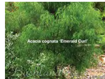
Acacia cognata 'Emerald Curl' Bower Wattle Native shrub. Cultivar 'Emerald Curl' 4 x 3m Sun light shade.