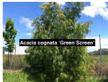
Acacia cognata 'Green Screen' Bower Wattle Native shrub. Cultivar 'Green Screen' 4 x 2m Sun light shade.