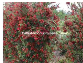
Callistemon hybrid 'Slim'

Native shrub 1 x 1m Sun or part shade. Bird attracting.