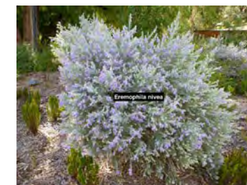
Eremophila nivea Silky Eremophila

Native shrub. Cultivar 'Roseworthy' 10cm x 1.2m Bird attracting desert plants. Sun.