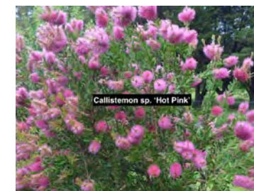
Callistemon splendens X pallidus 'Hot Pink'

Native. Cultivar 'Slim' 3-4 x 1-2m Sun. Heavy or light soil. Few or no remnant fruit.