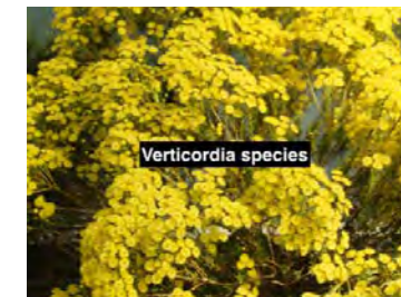
Verticordia species Featherflower

Evergreen 2 x 2m. Small white flowers along stems. Full sun.