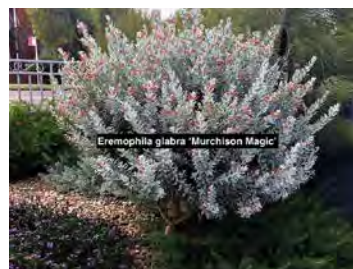
Eremophila glabra 'Murchison Magic'

Native shrub. Cultivars 'Silver Ball' 70cm x 1m. Bird attracting desert plants. Sun.