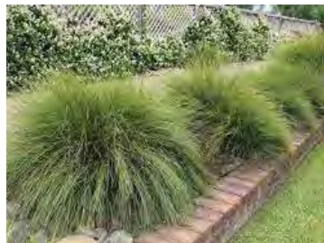
Lomandra hybrids 'Wingarra' Mat Rush