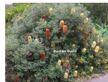
Banksia media Southern Coastal Banksia Native shrub 4m. Acid sand. Sun.