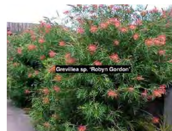
Grevillea hybrid 'Robyn Gordon' Grevillea (shrub)

Native shrub 1.5 x 1.5 m. Silver grey foliage red pea flower. Sun, well drained soil responds well to pruning.