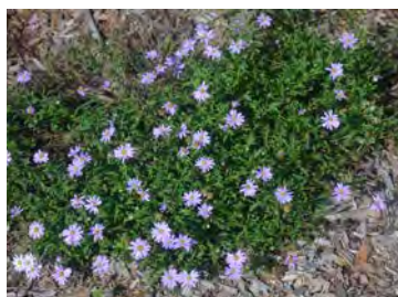
Brachyscome multifida Cut Leafed Daisy

Evergreen 30 x 30cm. Frequent blue daisy flowers. Full sun part shade.