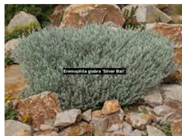
Eremophila glabra 'Silver Ball'

Native shrub 1 x 1m. Decorative pink flowers. Full sun to half shade. Well drained mulched soil.