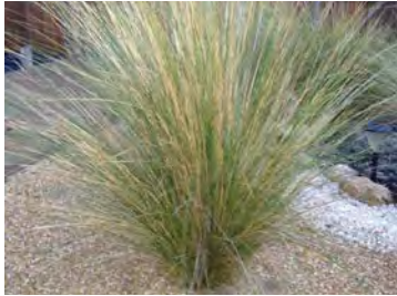
Austrostipa stipoides Coast Spear Grass