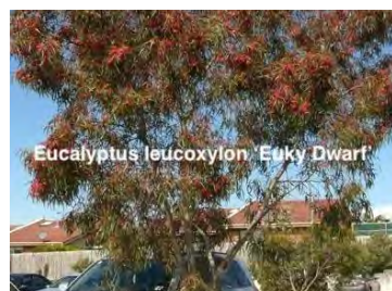
Eucalyptus leucoxydon 'Euky Dwarf' Gum Native gum 6 x 4m. Often red or pink flowers.