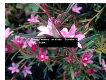
Crowea exalata 'Southern Stars' Crowea

Indigenous and native varieties and habit. Sun or part shade Pictured: Remarkable Rocks