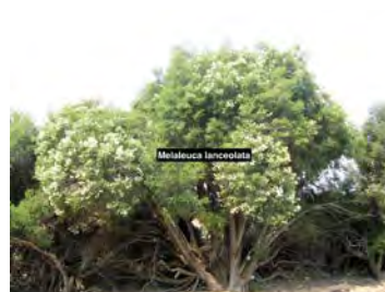
Melaleuca lanceolata Moonah Indigenous tree 6-7m x 6m. Often multi trunked. Can be trimmed. Sun. Plant 5-6 metres from house.